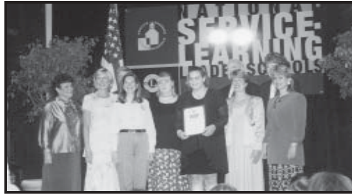
2000 Presidential Award for Service-Learning

The Wildlife and Aquatic Education Program led by Nevada Division of Wildlife in partnership with Washoe County School District and Americorps volunteers became nationally recognized with the 2000 Presidential Award for Service-Learning for its outstanding achievement in improving education and strengthening communities through Service-Learning. Middle school students peer taught aquatic and wildlife education to elementary school students arriving for field trips at the Oxbow Nature Study Area.