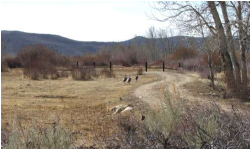
Rio Grande turkeys in Carson River corridor near release site.

One release of Rio Grande Turkey was made during state fiscal year 2009. This release took place in southern Carson Valley located in Douglas County. The total release complement of 59 birds consisted of 23 jakes (males) and 36 jennys (females). Trapping was conducted by the National Wild Turkey Federation in cooperation with the California Department of Fish and Game. Samples were obtained from approximately 10% of the total number of birds captured and a battery of tests was conducted for several diseases by the Wildlife Lab in Rancho Cordova, California. All birds were cleared prior to release in Nevada.