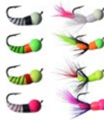
Standard ice flies for Yellow Perch

Species are typically self-supporting in Dufurrena Ponds, but periodic stocking may be required to supplement existing populations